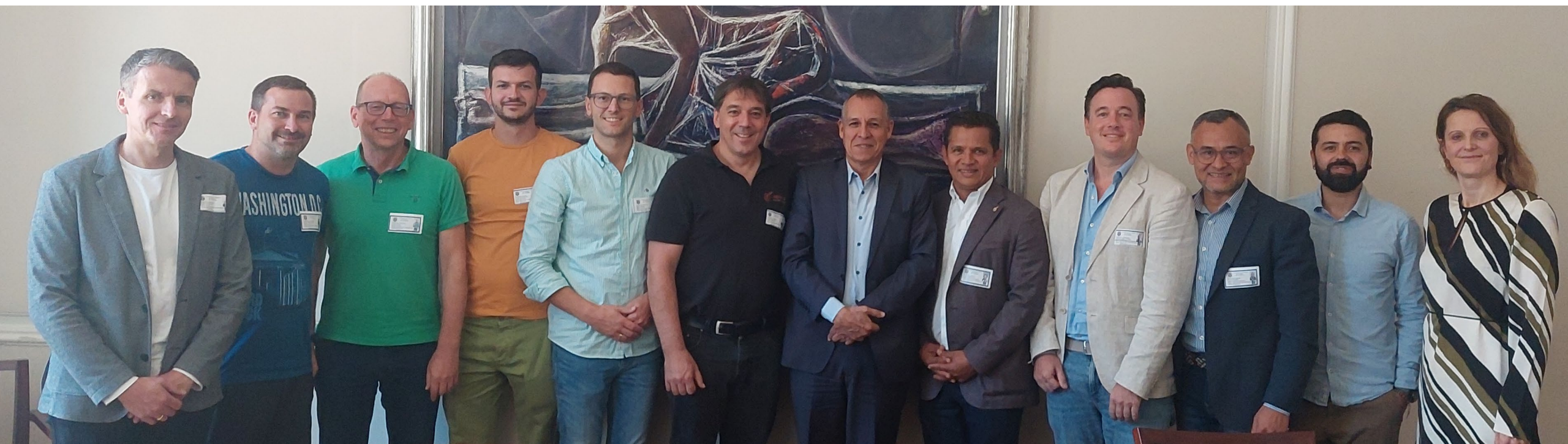
Delegation in the President's Palace