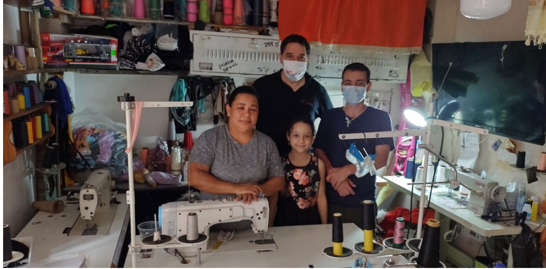
Small credit program for wives of prisoners