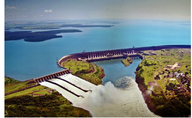
Itaipu – worlds largest energy source