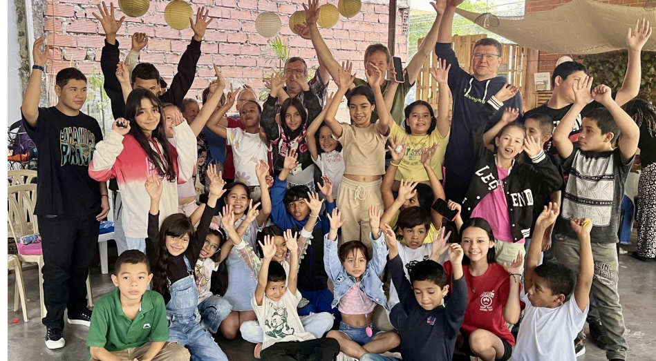
Program for children of prisoners

Visit of children of prisoners. Through the sponsorship program the children can go to school, have enough to eat, get medical treatment and participate at community live. Through a small credit program they can become financially independent, take responsibility for themselves and regain their dignity.