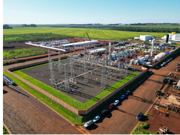
Penguin Group Data Centers

We will visit the Iguazu Falls, the largest waterfall system in the world with around 275 individual cascades stretching nearly 3 km along the border between Argentina and Brazil.